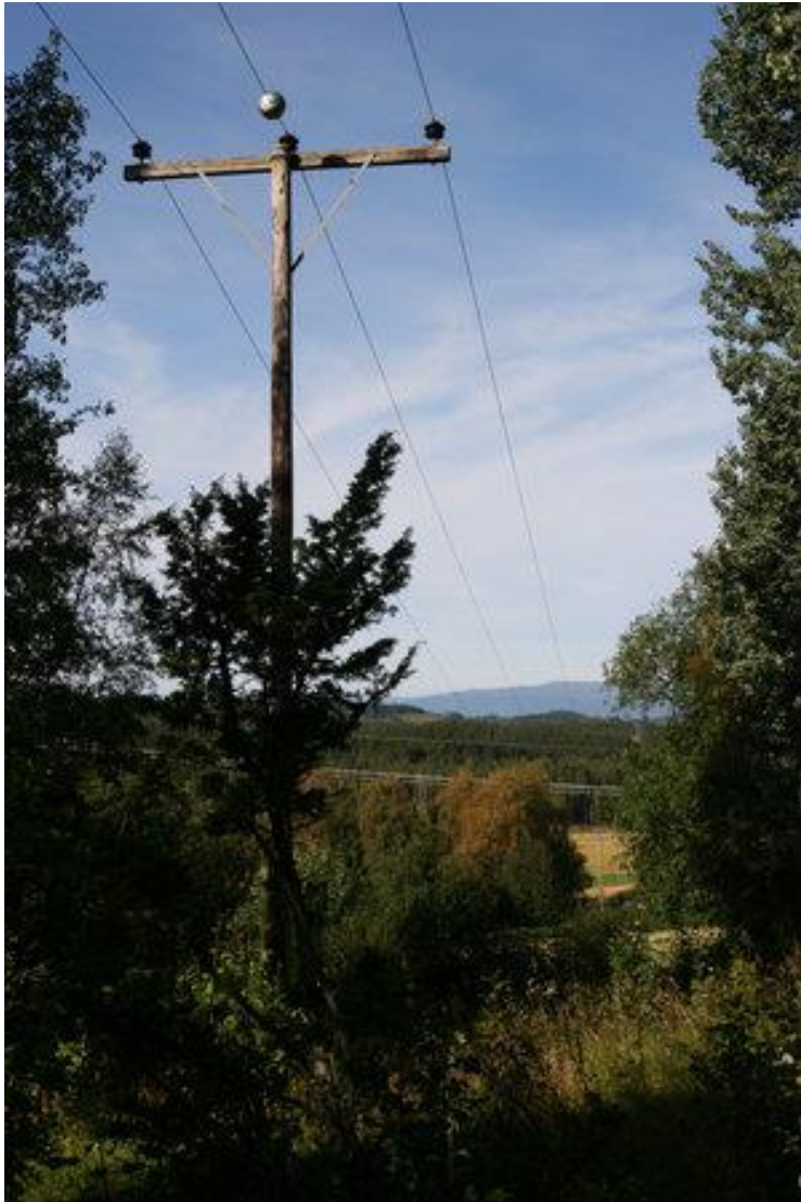
High voltage overhead line of the Fraunhofer IMS for Condition Monitoring.